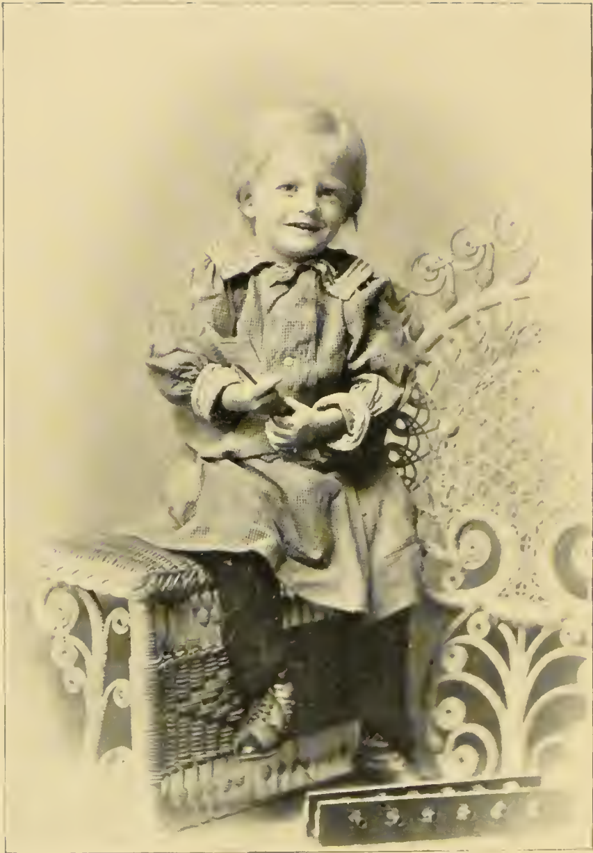
THE THEORETICAL BABY AT 18 MONTHS.